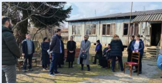
Public Defender visit to IDPs in Shamgona Village

The Georgian PDO, established in 1996, has developed a strong expertise in promoting and protecting the human rights of IDPs from conflict-affected areas. It receives and investigates large numbers of complaints related to internal displacement. Regional representatives of the Georgian PDO actively monitor the situation with respect to IDPs in the former IDP settlements and provide legal assistance to them. PDO representatives provide information about the challenges identified during the visits within the scope of their competence and cooperate with the local government to address these challenges. The Georgian PDO also dedicates a specific chapter of its annual parliamentary report to IDP rights.