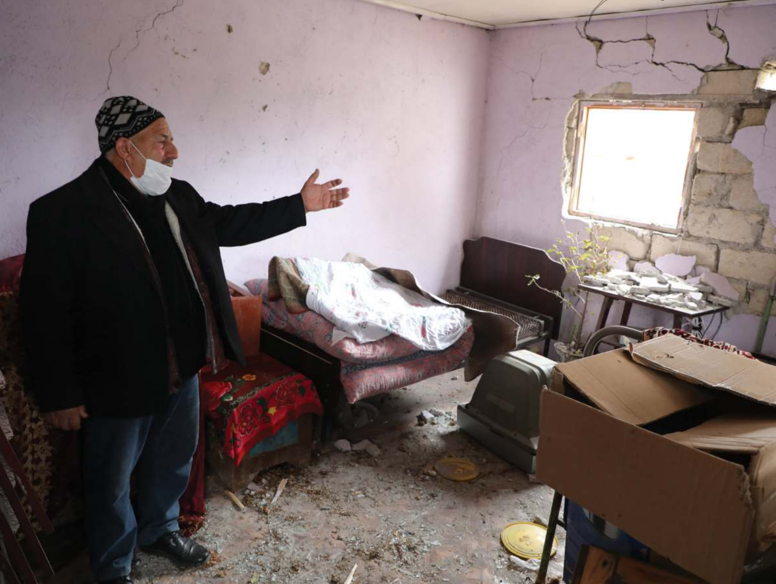
A 66-year-old internally displaced Azerbaijani man was displaced from Banovshalar settlement in the Agdam district, near the disputed territory of Nagorno-Karabakh (2020).