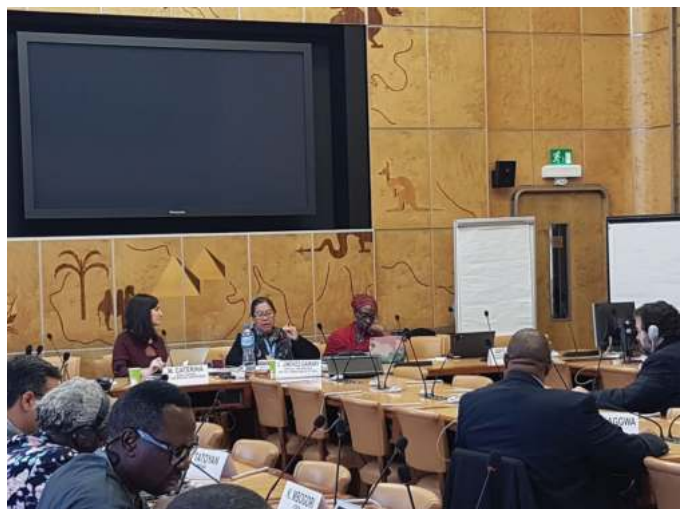
Special Rapporteur on the human rights of IDPs opening the 2018 roundtable with NHRIs

This handbook was developed during the COVID-19 pandemic, which has had a dramatic impact on the most vulnerable, among them many IDPs. Witnessing this impact has served as a harsh reminder of the importance of a human rights-based approach that prioritizes the respect, promotion, protection and fulfilment of the rights of all, particularly those in vulnerable situations. The fundamental role NHRIs can play has therefore never been clearer.