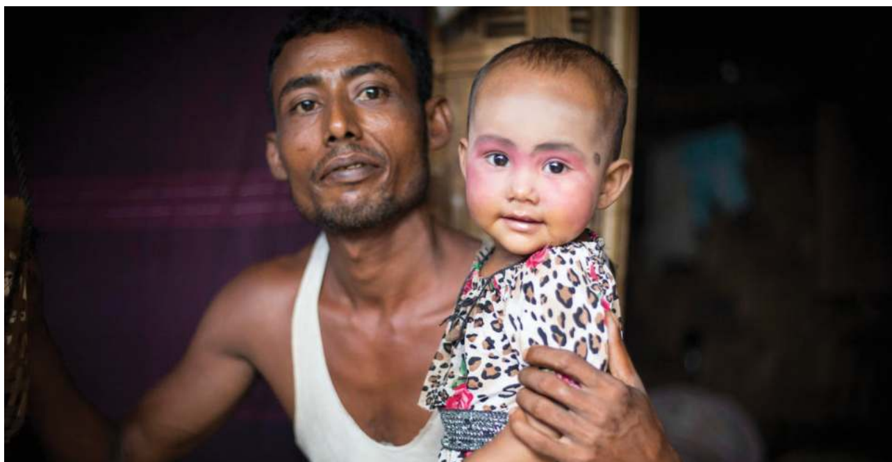
A displaced Rohingya father and his child at Dar Paing camp for internally displaced people in Sittwe, Rakhine state, Myanmar (2017).