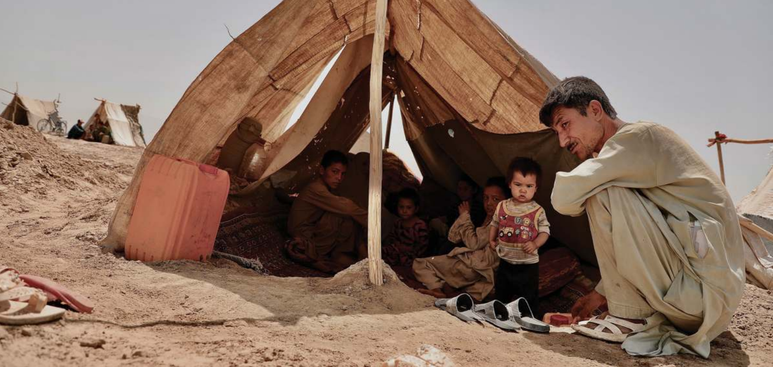
Families displaced by the conflict in Afghanistan are forced to live in makeshift tents in the Brigade settlement (2021).