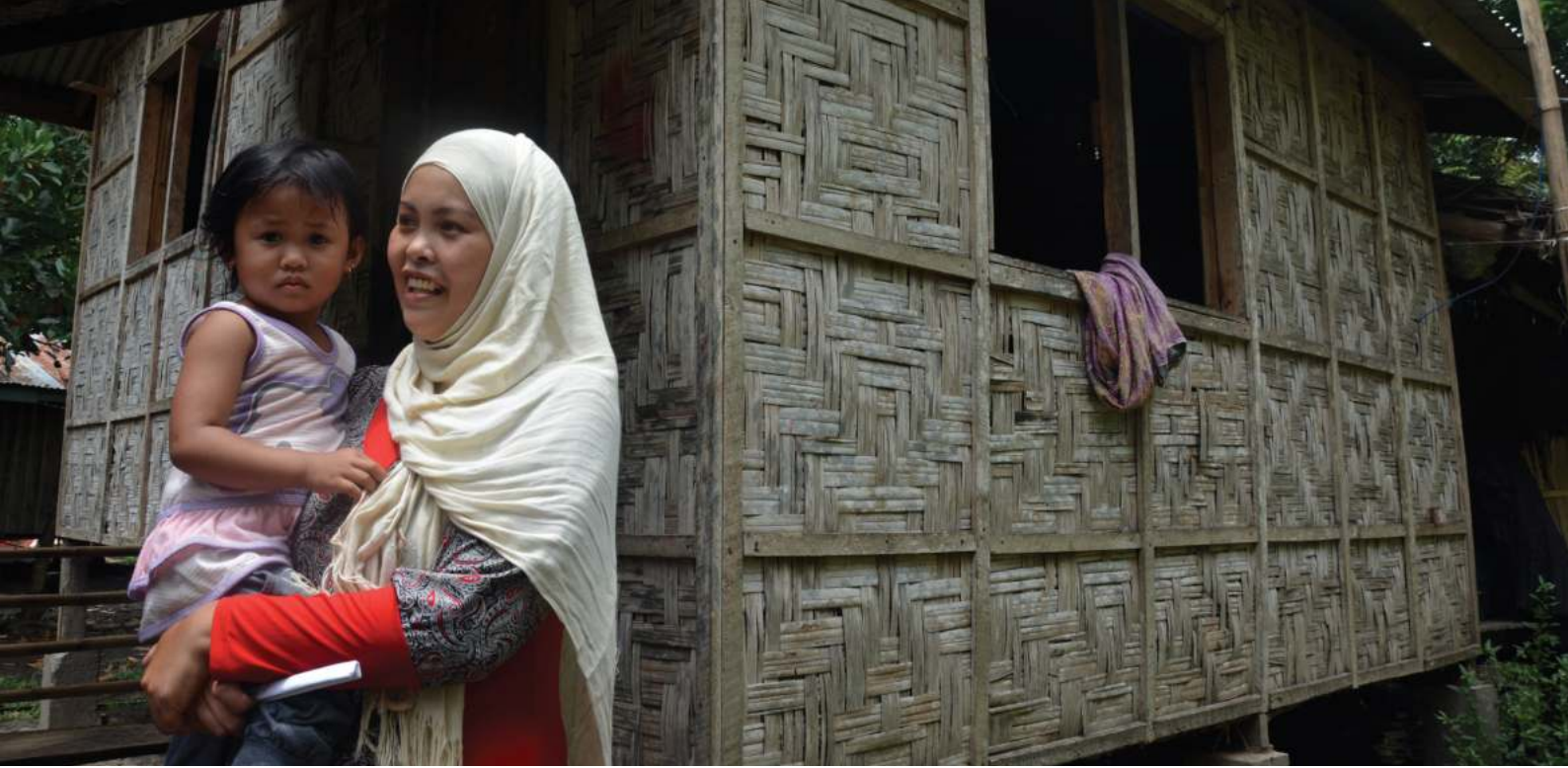
A displaced woman with her child in Madiya, Philippines (2017).