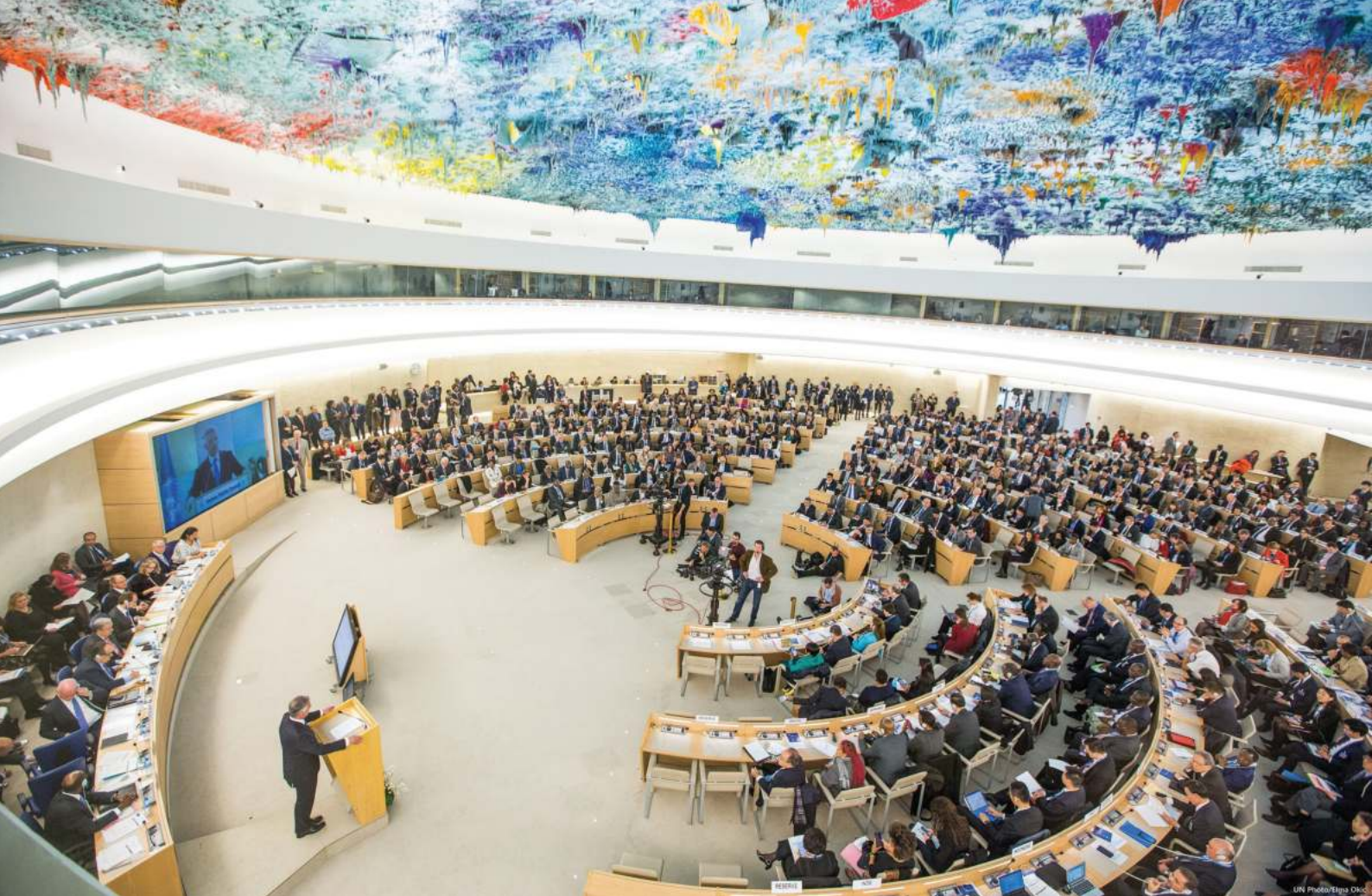
UN Human Rights Council.