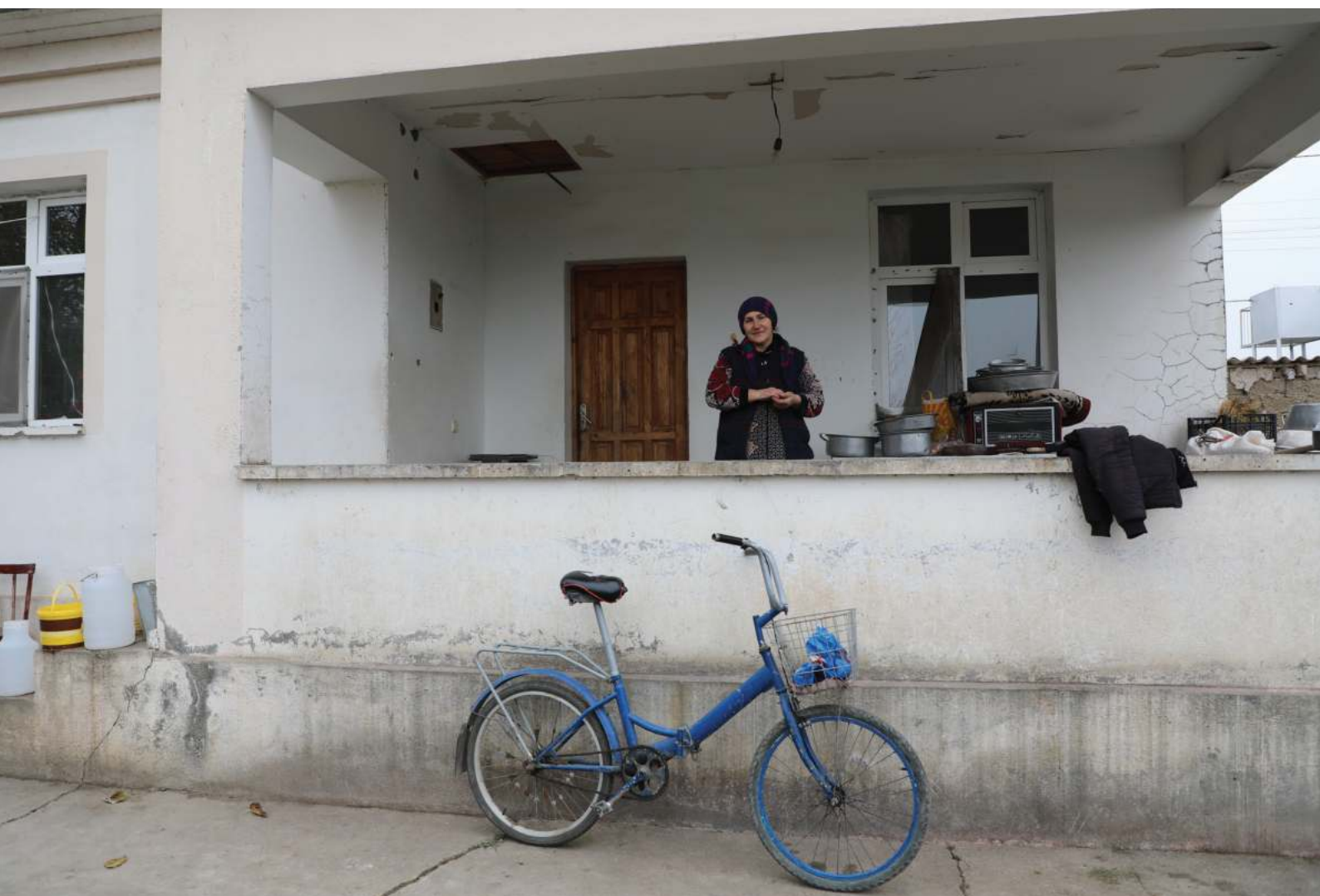
A 51-year-old internally displaced Azerbaijani woman was displaced from Dordyol 1 settlement in the Agdam district, near the disputed territory of Nagorno-Karabakh (2020).

Working with inadequate or inconsistent funding are commonly cited obstacles to the work of NHRIs, hindering their capacity to address the human rights of IDPs. To the extent that it is relevant and feasible, NHRIs' core budget should include specific funding for activities on internal displacement to enable them to address internal displacement through their core and long-term activities, rather than temporary, project-based or one-off funds. While governments should legally ensure adequate funding and guarantee their ability to work independently, NHRIs must often expand their operations using existing resources, with obvious consequences. The institutions' ability to receive external funding, in line with the Paris Principles, 34 is of particular importance, as is the need to work with donors to enhance their understanding of the critical role and value of NHRIs in this area.