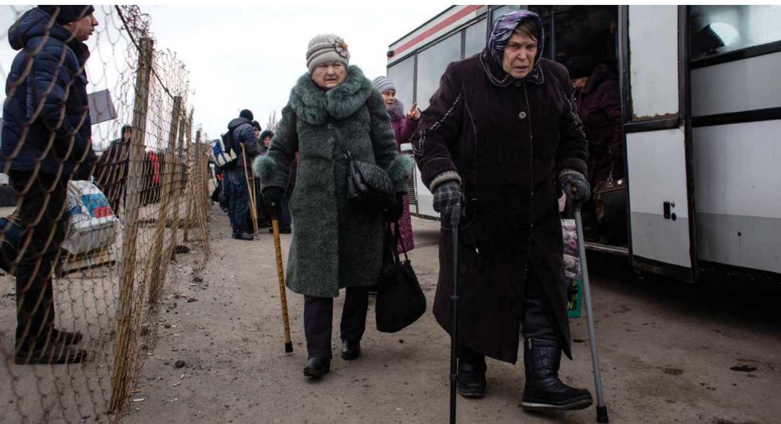
Residents in eastern Ukraine cross the border checkpoint between the government-controlled area and non-government controlled area in Mayorsk, Donetsk (2018).

According to the Ombudsperson, a more predictable and concrete way to protect the rights of IDPs and other affected citizens required legislative changes and consequently, they supported the proposal of a new law, entitled “On amendments to certain laws of Ukraine concerning the exercise of the right to a pension” (no. 2083-d of 26 November 2019) to regulate pension payments to IDPs and persons living in the temporarily occupied territories of Ukraine.