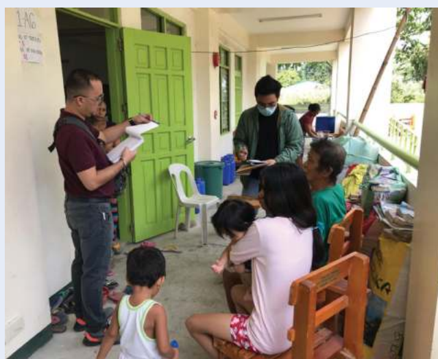
Interviews with IDP families affected by the Taal Volcano eruption in an evacuation site in Balayan, Batangas, February 2020

The Philippines is a country affected by recurrent internal displacement due to a variety of causes, including disasters resulting from natural hazards, conflict and large-scale development projects. In this context, the Commission on Human Rights of the Philippines (CHRP), which has a broad mandate for the protection and promotion of human rights, 49 has worked closely with UNHCR to address internal displacement, particularly through the establishment of a joint IDP project. A concrete result of this project was the development of an “ IDP displacement monitoring tool ” and accompanying User’s Guide 50 and Interview Guide to support field staff in their data gathering and analysis. The target users of the tool are CHRP’s staff and partners joining monitoring missions to ascertain the conditions of IDPs on the ground.