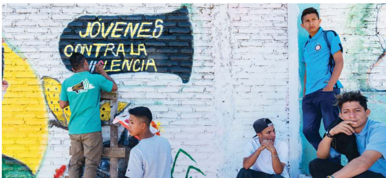
Leaders and volunteers of the organization ‘Youth Against Violence’ in Colonia Nueva Capital, Tegucigalpa, Honduras. The organization works throughout the country to empower youth through peace-building activities. Its founder and director, along with his family, are IDPs.