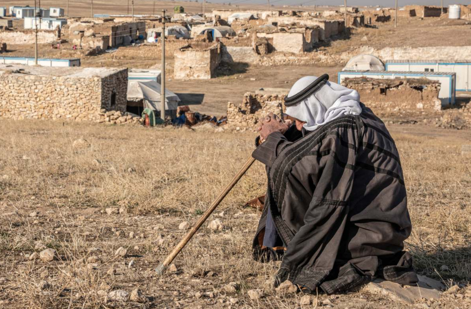
An elderly returnee sits near his destroyed home in a remote village in Nineveh, northern Iraq (2020).