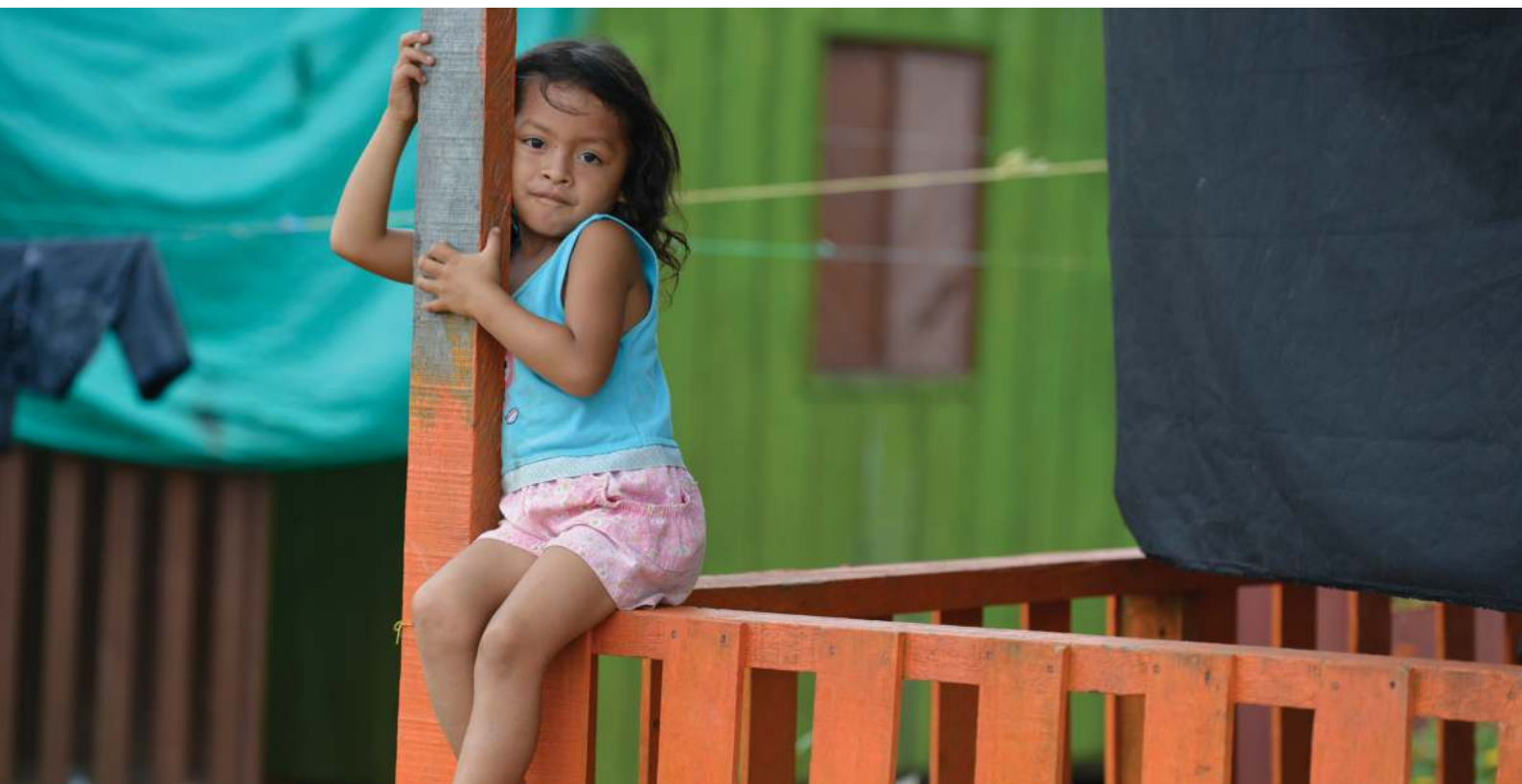
A five-year-old child plays outside her family home at a settlement for displaced people in Caqueta, Colombia (2013).