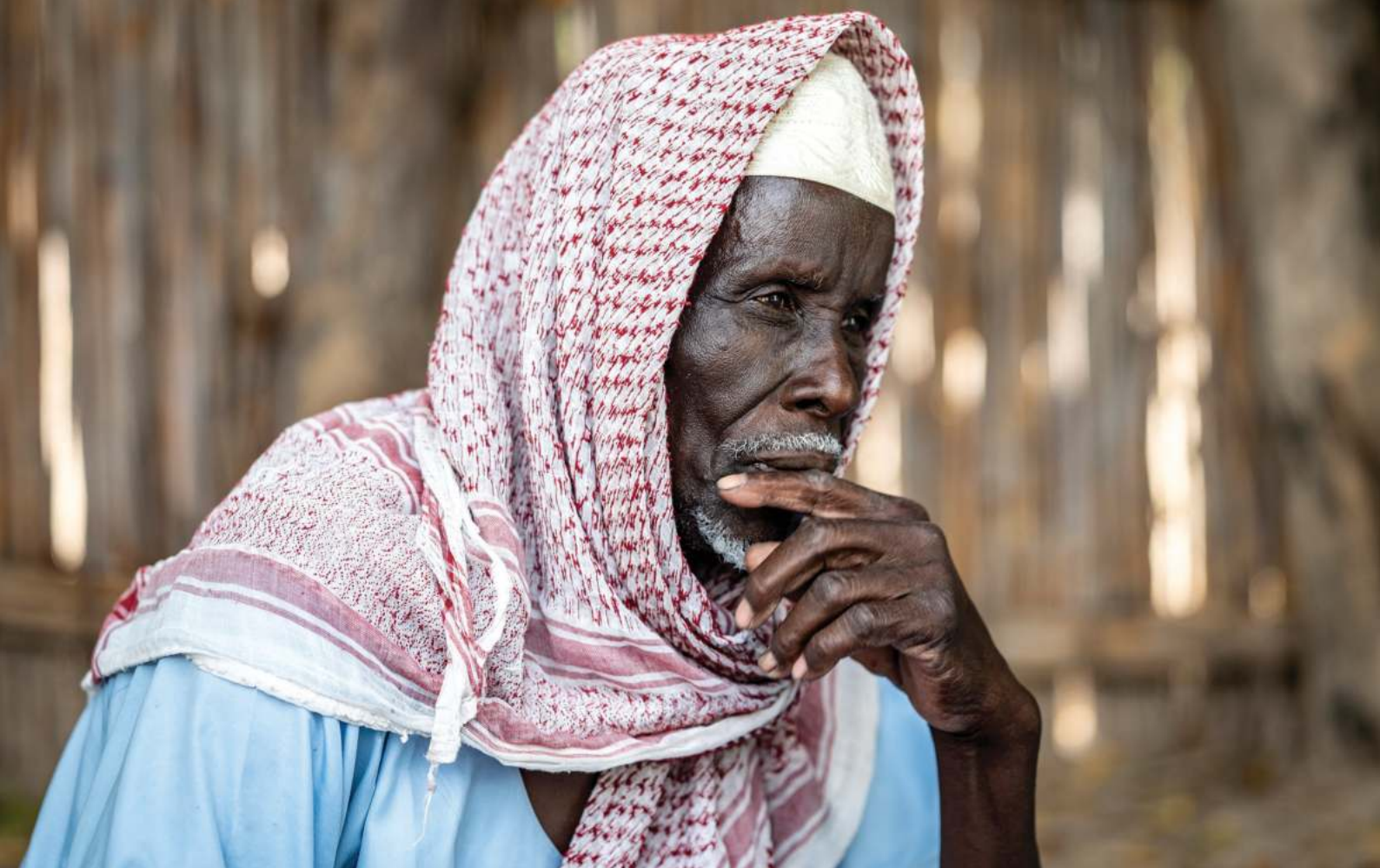
A Chadian farmer, 75, was forced to flee to Baga Sola in Lake Chad Province after Teteoua, his village, was attacked by Boko Haram militants in 2015 (2021).