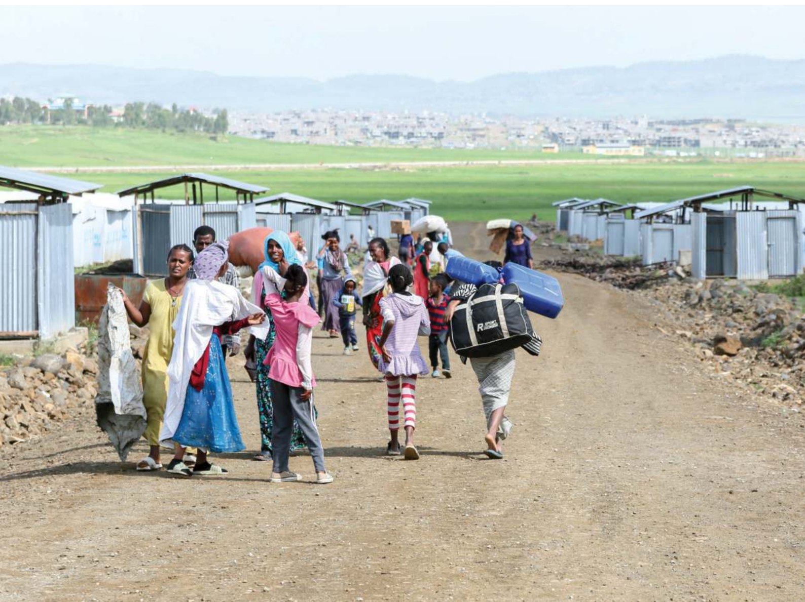
The relocation of internally displaced people to Sabacare 4, a new site constructed to shelter IDPs who cannot return home in Ethiopia (2019).

→ Watch this video to learn more about the project and ZHRC’s role: www.zhrc.org.zw/videos/ .