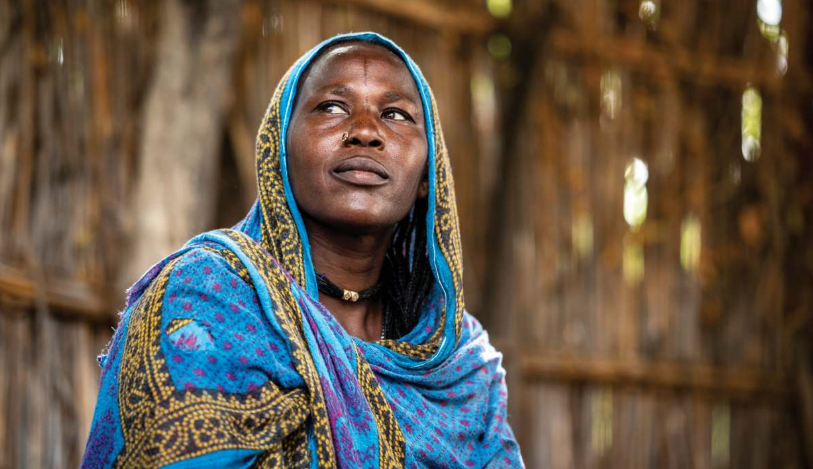
A Chadian woman, 40, was forced to flee to Baga Sola in Lake Chad Province after Teteoua, her village, was attacked by Boko Haram militants in 2015 (2021).