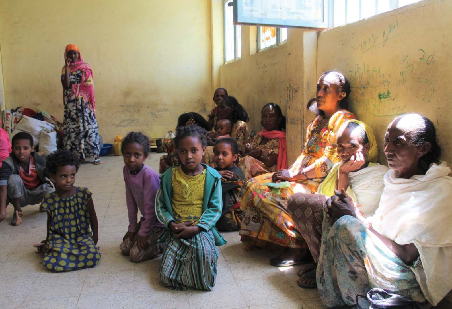
In Ethiopia's Tigray region, the conflict has displaced hundreds of thousands of people, who sought shelter in communal sites such as school campuses in the larger cities in the region, Mekelle and Shire (2021).