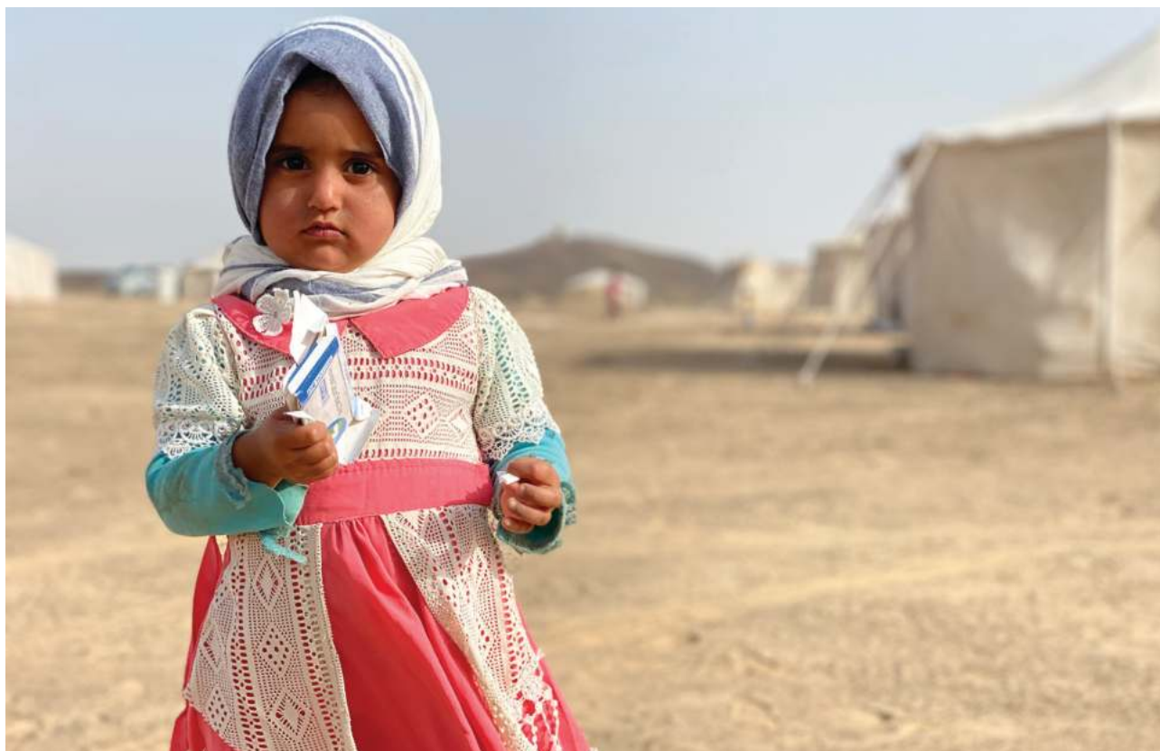
A two-year-old Yemeni girl, displaced by conflict in Al Jawf, at the hosting site for IDPs in Marib, Yemen (2020).

In 2019, the Commission organized a "mobile service provision day" in collaboration with relevant government authorities, with the aim of facilitating face-to-face interactions between the communities and service providers. The Commission used handbills and media outlets to announce the event. Among the public institutions invited were the Divisional Secretary, women development officers, land officers, probation officers, the registrar, the police, health officers, labour officers, legal aid officers and fisheries. The occasion provided an opportunity for the authorities to identify and undertake immediate-, medium- and long-term actions to address the protracted issues faced by IDPs and returnees, which the Human Rights Commission continued to monitor.