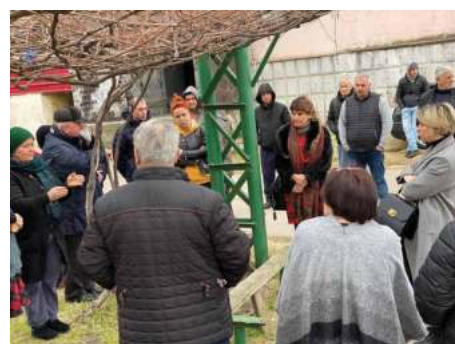
Public Defender meeting with IDPs living in Poti in February 2020.

For example in Georgia , in 2013, the Public Defender's Office (PDO) and several CSOs and international organizations conducted joint monitoring work to assess the human rights compliance of a countrywide renewed registration process for IDPs carried out by the State. The monitoring allowed the NHRI to gather detailed information on IDPs' situations, identify gaps in legislation and practice, and advise State bodies on actions required. The PDO has also developed strong monitoring systems on the housing situation of IDPs, providing regular recommendations through annual and special reports to State bodies on hazardous accommodation, and advising decision makers on IDPs' relocation as part of the durable housing solutions programme. 47