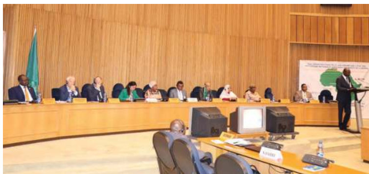
Opening session of the AUC-NANHRI Policy Forum on the state of African Human Rights Institutions, 5 September 2019.

As part of this cooperation, the two institutions worked with OHCHR and UNDP to organize the third Policy Forum on the State of Human Rights in Africa in 2019, which focused on durable solutions to forced displacement. This was in line with the African Union (AU)'s 2019 theme: “Refugees, Returnees and Internally Displaced Persons: Towards Durable Solutions to Forced Displacement in Africa” . At this forum, stakeholders developed and adopted a continental action plan on the contribution of NHRIs to durable solutions on forced displacements in Africa, with a strong focus on the promotion of the Kampala Convention. 69