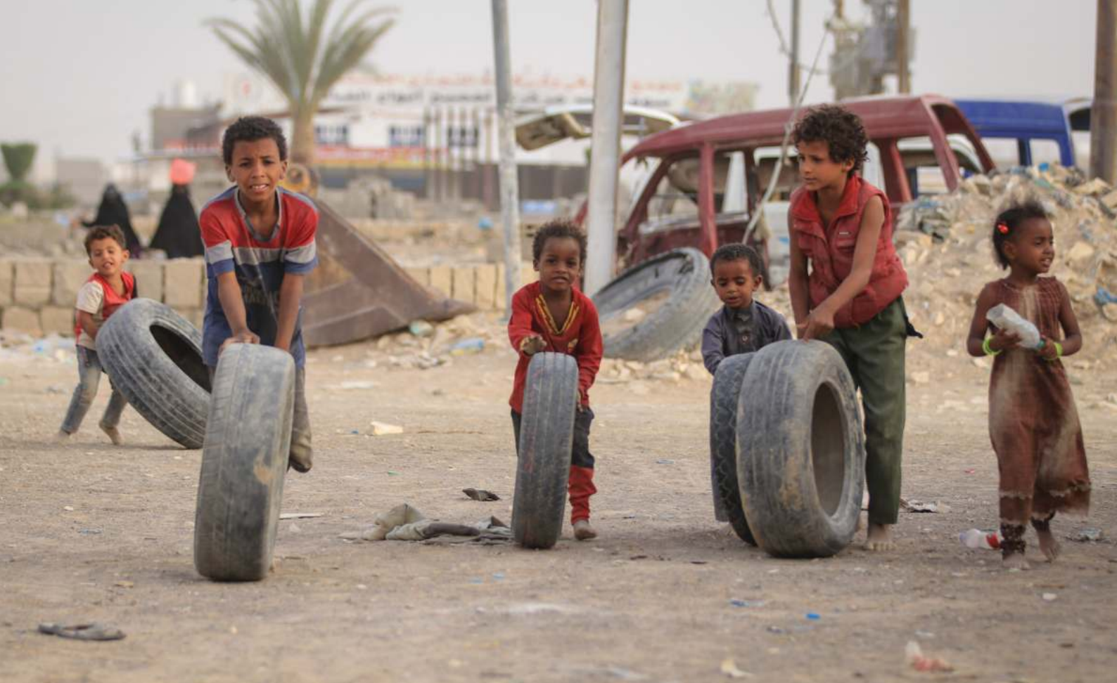
Displaced children play with tires in Al-Rawdah camp in Marib, Yemen (2021).