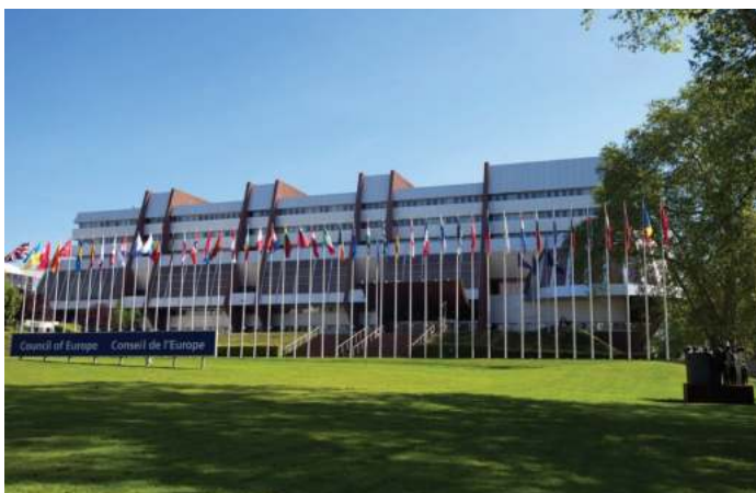
Palais de l'Europe.

Furthermore, while endorsing the Guiding Principles, the CoE Committee of Ministers has recognized that IDPs “have specific needs by virtue of their displacement” and has developed a set of 13 principles to guide member States “when formulating their internal legislation and practice” to ensure they effectively address internal displacement. 94 Similarly, in a recent recommendation – although not specifically on IDPs – the Committee of Ministers emphasized the “great potential and impact of independent NHRIs for the promotion and protection of human rights in Europe,” and made a series of recommendations on establishing and strengthening NHRIs while securing and expanding a safe and enabling environment, as well as promoting cooperation and support for NHRIs. 95 In the same vein, the Parliamentary Assembly of the CoE (PACE) has adopted various recommendations and resolutions highlighting, inter alia, the need for “continued international assistance to IDPs” and the important role that NHRIs can play in monitoring and protecting IDPs’ rights. 96