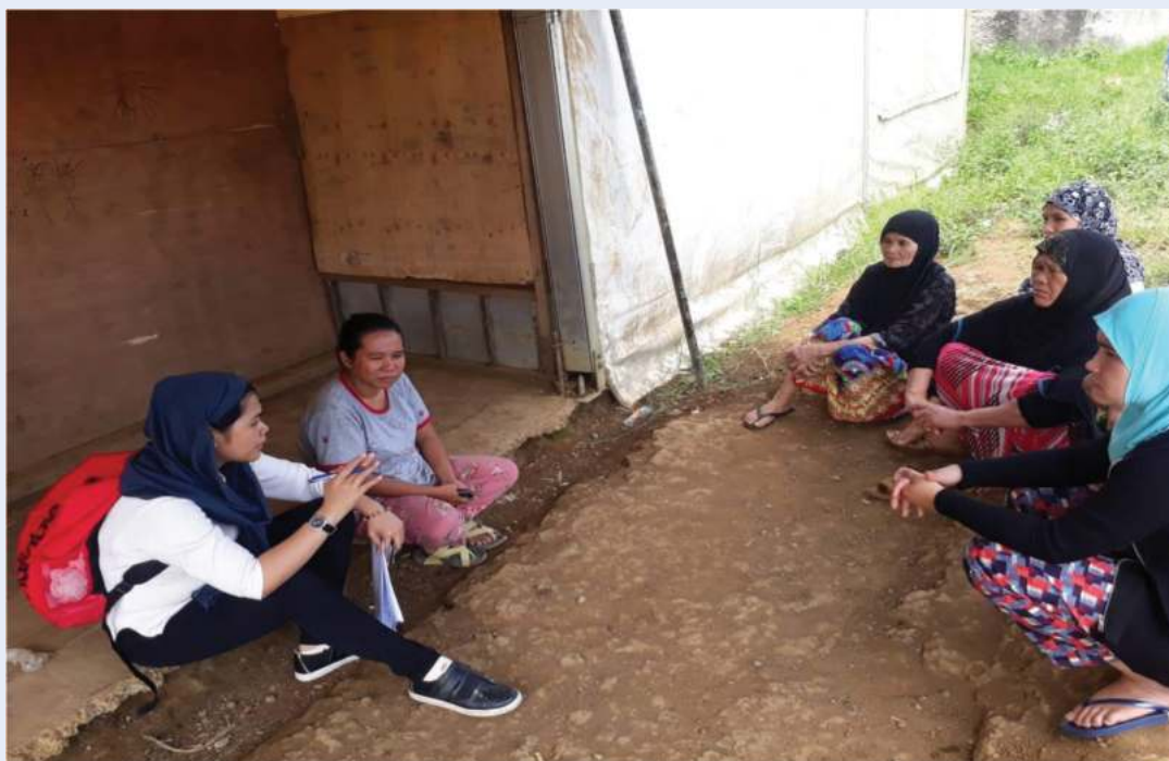
Interview with IDP women leaders in an evacuation site in Marawi City, May 2019

In the Philippines , the Commission on Human Rights established a Regional Office based in the conflict-affected Autonomous Region in Muslim Mindanao (ARMM). The CHR-ARMM Regional Office was a good example of how the decentralization of IDP-related functions, such as IDP monitoring, can be particularly useful in instances where a region of the country merits more intensive IDP protection work than others.