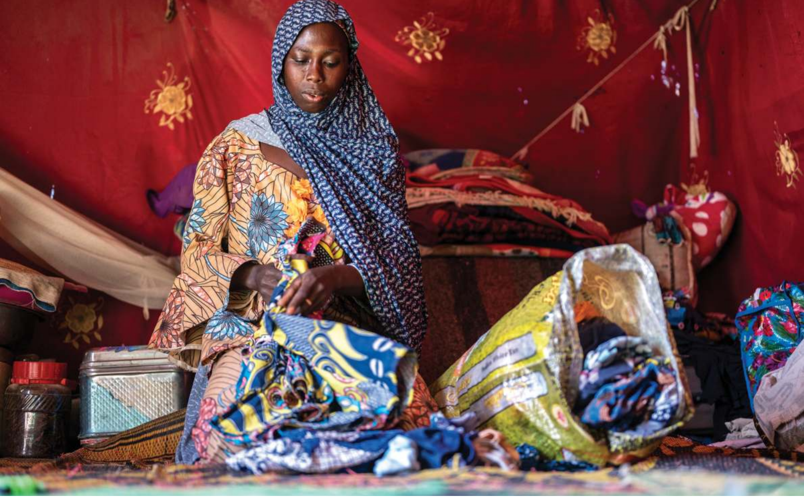
A 30-year-old Nigerian woman was forced to flee to Diffa in 2019, when heavy rains flooded her crop fields and house in Chitemari, Niger (2021).