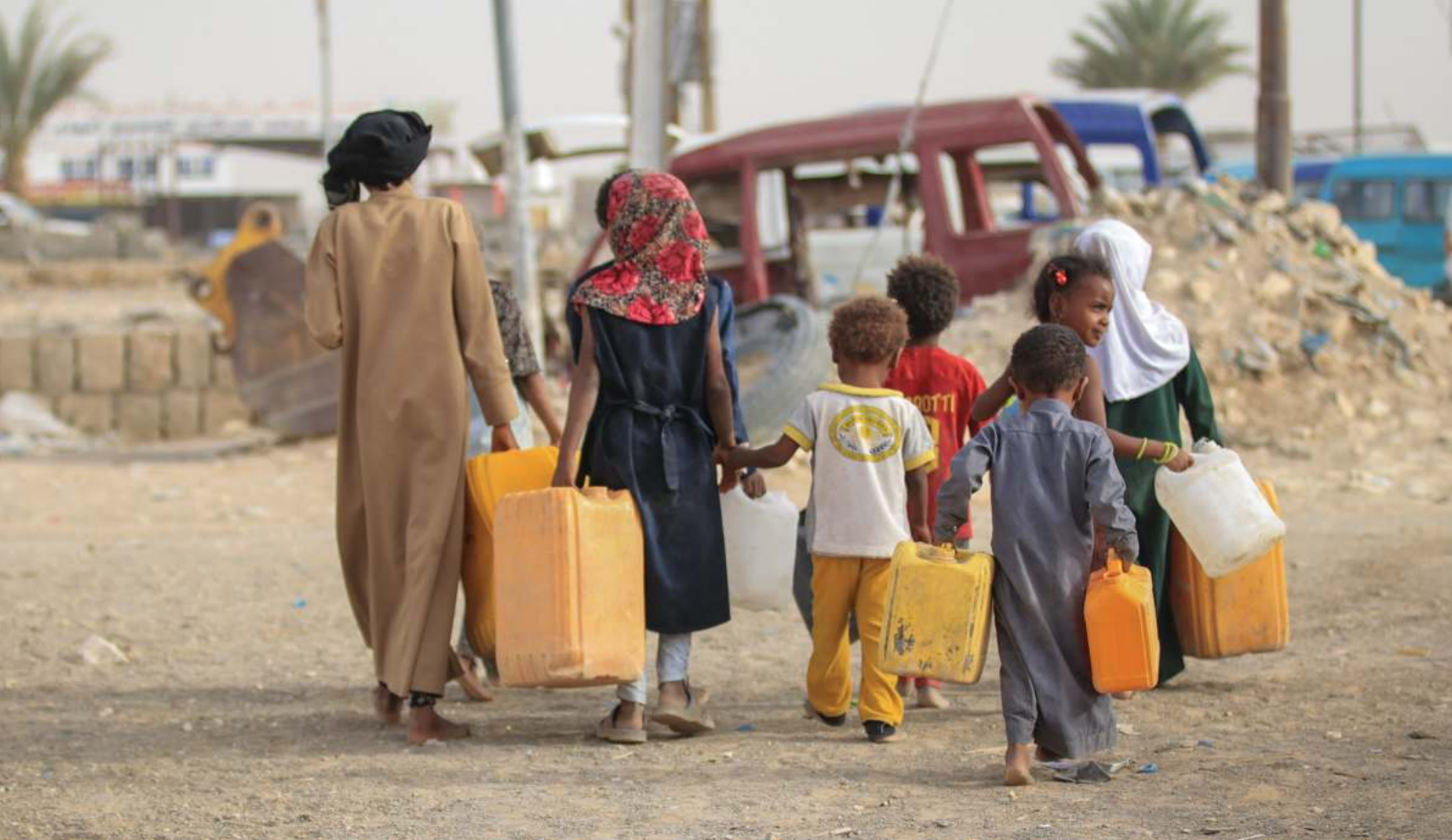
Displaced children going to fill water from the water distribution point in Al-Rawdah camp in Marib, Yemen (2021).