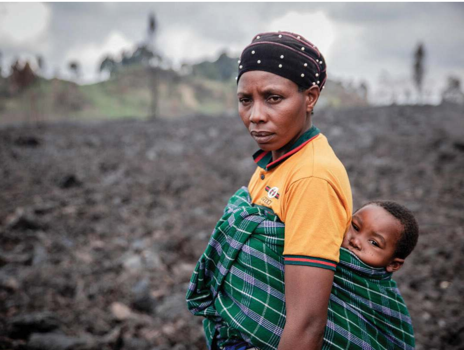
Democratic Republic of Congo: more than 350,000 people were displaced by eruption of the Nyiragongo volcano in Goma. Here an IDP woman, aged 40, visits the spot where their house once stood with one of her 7 children (June 2021).

The Commission has been resolute in continuing to advocate for not just the full implementation of the Decision for the benefit of the Endorois but also for comprehensive legal, policy and institutional reforms to protect the rights of local communities and indigenous people in similar circumstances. This example is illustrative of the need for collaborative, sustained and multi-pronged strategic efforts by communities, civil society and NHRIs to promote and protect the rights of vulnerable citizens, particularly against forced evictions.