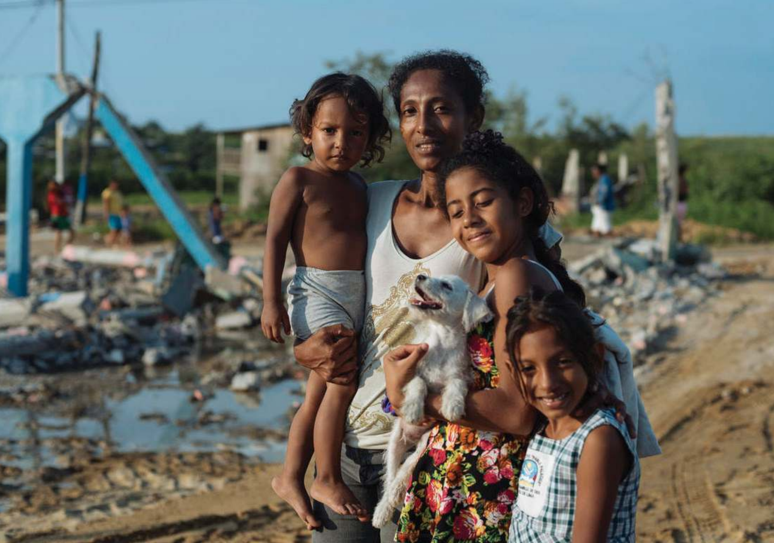
An Ecuadorian woman and her children were left homeless after the earthquake destroyed 90% of the houses in Chamanga, Ecuador (2016).