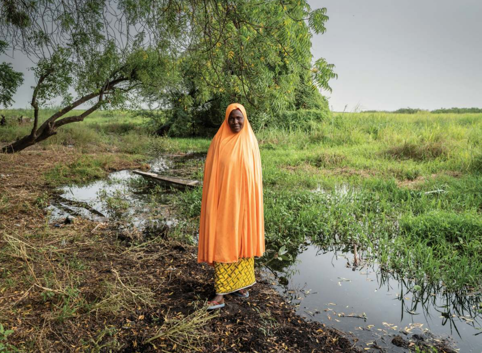
A Chadian woman, 40, was forced to flee to Baga Sola in Lake Chad Province after Teteoua, her village, was attacked by Boko Haram militants in 2015 (2021).